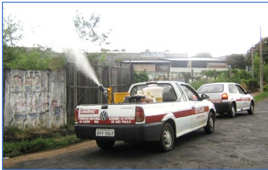
Invisible disinsection with pulsFOG "SUPER PRO" ULV machine