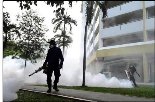
For control of easily recognisable external disinfection and disinsection of traffic areas around residential buildings with pulsFOG thermal foggers using fogging additive in the biocide solution.

Fogging disinfection using the ULV process ( Ultra Low Volume ) is a noticeably drier treatment with 100 times less dilution (less water). Due to its dual effect of room and surface treatment, it is one of the most successful control methods when one considers cost-effectiveness, effectiveness, environmental protection and simplicity of implementation as a whole. Taiwan, the most successful country in epidemic control, uses pulsFOG equipment for its brigades. Experiments carried out as early as the 1970s at the TU Munich (Technical University) with different droplet sizes led to the important finding: the smaller the droplet diameter at higher concentrations, the better the biological result (also found under Matthews: "Pesticide Application Methods", IPARC Institute London).