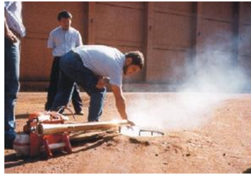
Aerosol disinfection and pest control of urban sewers

lounges, waiting rooms and meeting rooms, such as schools, cinemas, theatres, sports stadiums, grandstands, prayer rooms, residential and park areas around hotels, as well as slaughterhouses, animal stables, work and guest rooms, kitchens, railway stations, airports and ports. They also includes transport containers such as ships, containers, cars for laundries, buses, trams, railway carriages and aircraft. Last but not least, the pipe and filter systems of air conditioning systems and underground sewers, which lead from hospitals, animal stables, slaughterhouses, hotels and restaurants to the municipal sewage treatment plant have to be considered. These underground pipe systems connect the sources of infection (e.g. hospitals) with the still clean environment (e.g. hotels, inns), as a result of which the disease is spread by nocturnal vectors (disease carriers