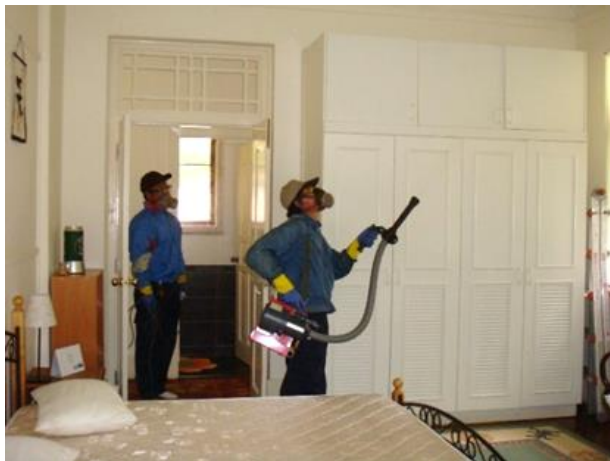
Indoor application with cable-bound electric cold fogger. Such devices with low noise levels are preferably used in hospitals, hotels and catering establishments.

cleansed of dirt deposits and treated with biocides, taking into account the objects they contain. Unmaintained air conditioning systems in office