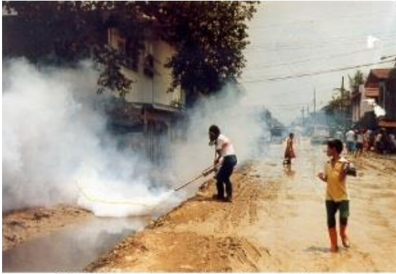
Vector control along the roads

Due to the dual effect in the space and on the surfaces, the dosage in the open air can also be carried out per unit surface (e.g. per ha), with setting a slightly larger droplet spectrum on the fogger ( <100\ \mu\text{m} ). In this case, the average quantity would be used that, according to the label, is conventionally sprayed