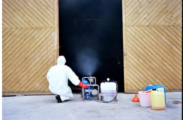
Treatment of a warehouse from the outside to the inside with a fogging range of up to 100 m