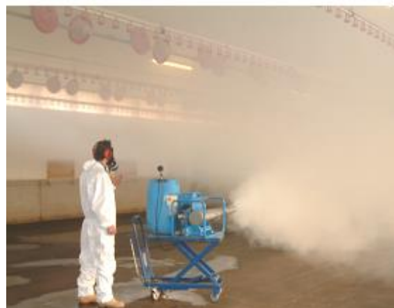
Large room disinfection with mobile fogger

After initial signs of illness, transmission risks are to be minimised through the avoidance of unprotected contact with detected infected organisms and risk areas, social distancing and hygiene measures ( such as washing hands, cleaning doorknobs ). Risk areas can be all buildings frequented by humans, animals and insects, e.g. hospitals, barracks, bathrooms, public toilet facilities, garages,